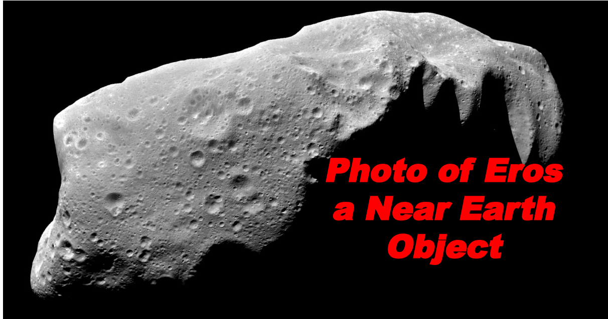
Photo of Eros a Near Earth Object